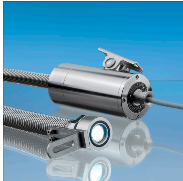
Lumistar luminaire 'Lumiflex' ESL55LED-ALF-Ex

Ex-type luminaires are manufactured with a permanently connected cable. The free ends of the connecting cable must be installed in a class 2G/2D housing if connection is carried out in the potentially explosive area. Prior to installing the luminaire or during maintenance work on it, both the luminaire and the surrounding area should be cleared of dust. The dismantled parts should be protected against dirt and dust during installation and maintenance work. When closing the luminaire, it is essential to take care that there is no dust inside. For applications in areas where there is a risk of dust explosions, the connecting cable should be laid so that it is protected against electrostatic discharge.